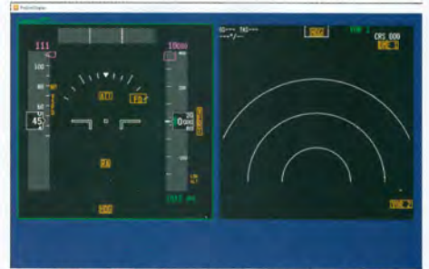
The ProSim Display is used to align the MFDs to your monitors.

Once the software is installed and integrated with the hardware, the IOS program allows you to setup and operate the aircraft without recourse to the flight simulation menus. So,