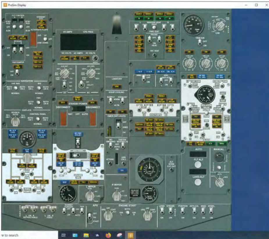
If you don't have all the hardware, you can use the on-screen panels.

of displaying any of the other available instruments or variations of them. They are normally selectable from rotary switches on the MIP and EFIS units at each end of the MCP. The other two monitors I have are bare 10-inch screens mounted vertically in the centre of the MIP and used for monitoring the various EICAS systems. Once again, the crew has the facility to change the specific information these MFDs are showing.